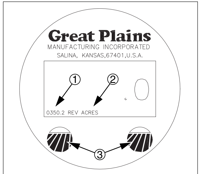
Figure 3 Meter Display