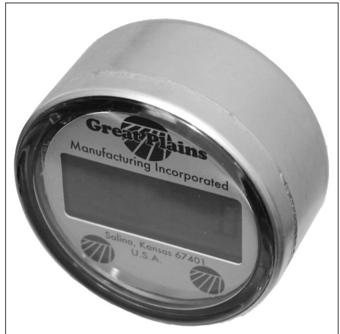
Figure 1 Electronic Acremeter